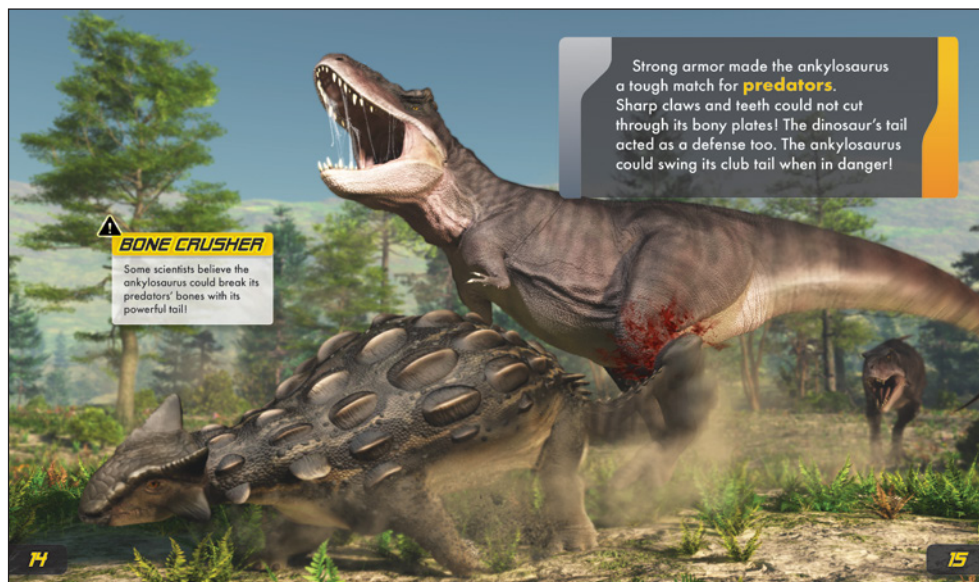
Sample spread from Ankylosaurus